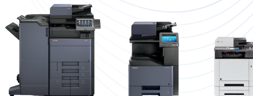
Kyocera TASKalfa & ECOSYS Office Printers & Multi-function Devices