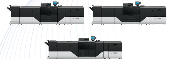
Kyocera TASKalfa Pro 15000c High Speed Inkjet Printers