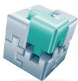
PRINT/DIRECTOR™ SERVER EDITION